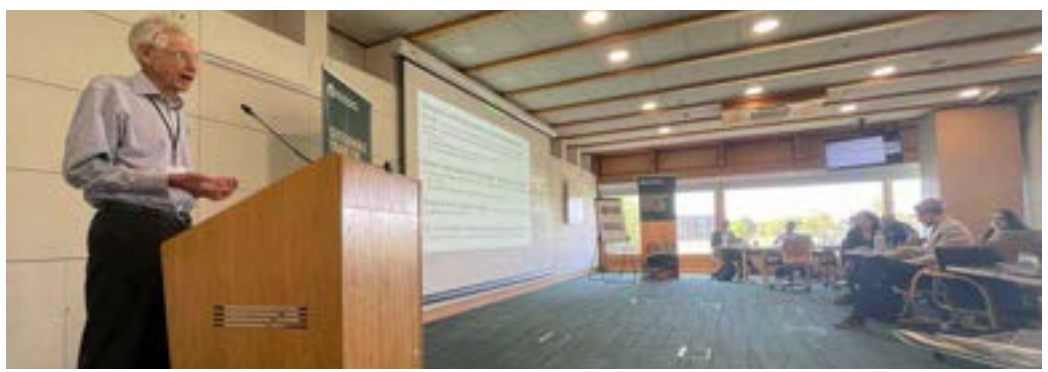
Sir Graham Wynne presenting to the group.

Sir Graham Wynne highlighted how the UN climate convention (United Nations Framework Convention on Climate Change - UNFCCC)<sup>7</sup> has shifted in recent years to more heavily consider the role of forests and other natural habitats like peatlands in the climate system, and the prevention of greenhouse gas emissions linked to global warming. At the last conference of parties in Glasgow in late 2021 (UNFCCC COP26), this included several important declarations around deforestation-free supply chains<sup>8</sup> (Box 1).