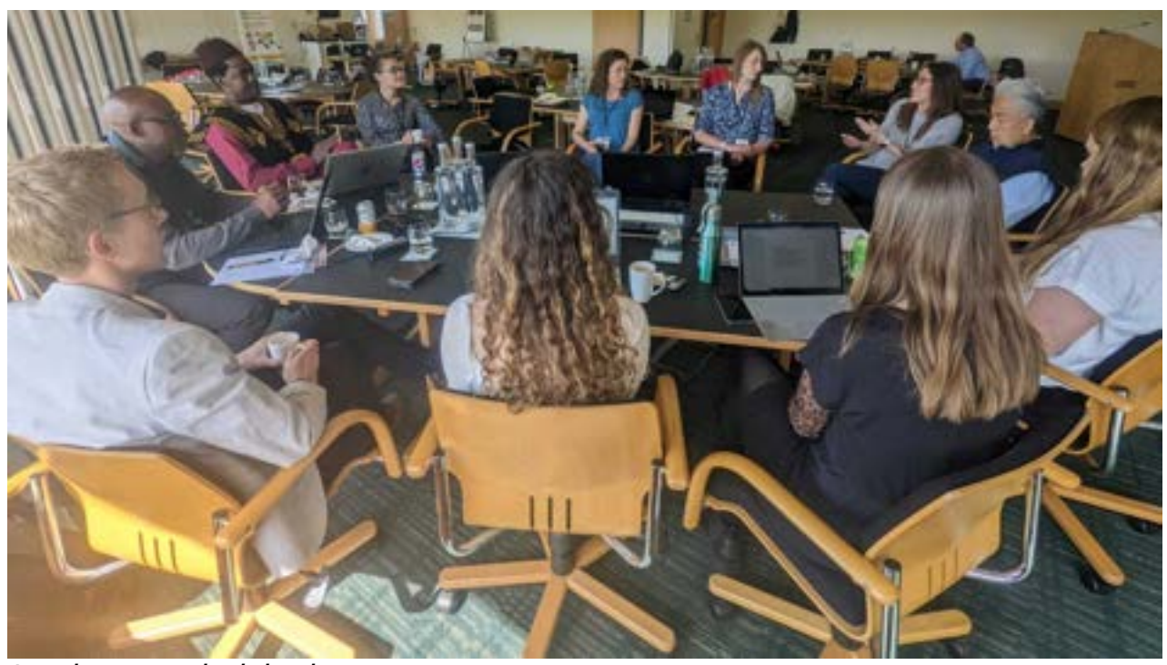
Attendees conversing in breakout groups.

During the meeting we convened several working groups to discuss different aspects of the agricultural supply chain system from farmers to consumers and focusing on the key commodities that are under study by the TRADE Hub. The formulation of these groups was informed by the work done in the TRADE Hub interim impact report.<sup>30</sup>